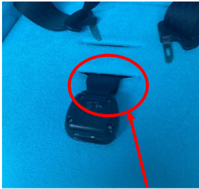
Figure 1. Crotch buckle opening