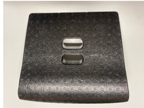
Figure 2. EPP foam seat cushion