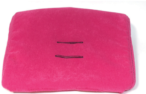
Top side of fabric

Description: Foam padding on underside of fabric. The foam padding is NOT stitched to the fabric at the crotch buckle holes.