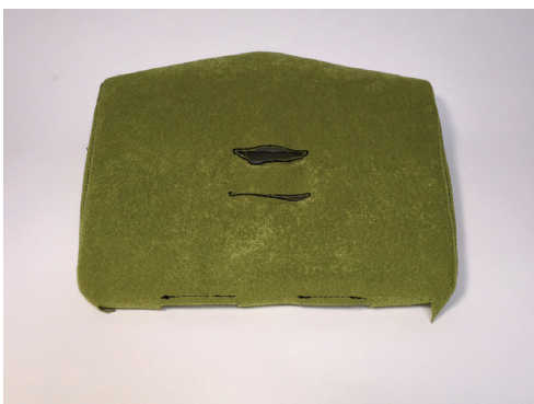
Top side of fabric

Description: Woven fibrous material that feels like cotton batten. The padding is NOT stitched to the fabric at the crotch buckle holes.