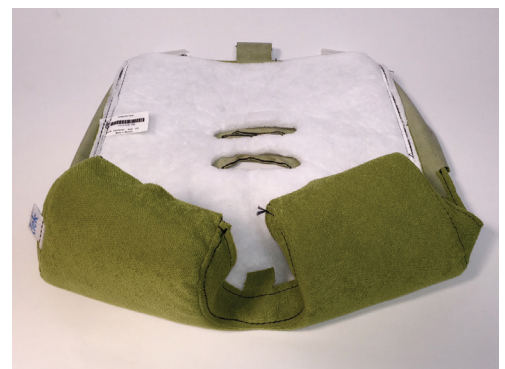
Bottom side of fabric