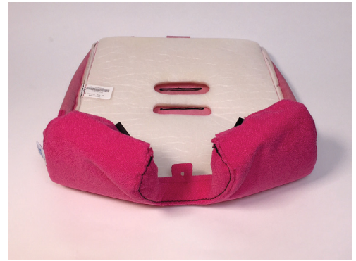
Bottom side of fabric