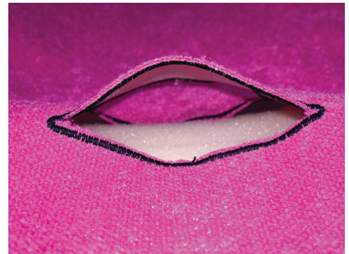
Crotch buckle hole