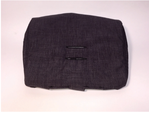
Top side of fabric

Description: Woven fibrous material that feels like cotton batten. The padding is stitched to the fabric at the crotch buckle holes.