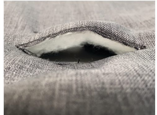
Crotch buckle hole

If you have a product that fits the production period, style, color and code characteristics described above, and you would like a replacement cover, please call our customer service team at 1-866-656-2462, or contact them via email at customerservice@clekinc.com with your product's serial number, image of the seat (if possible) and your contact information. Clek will arrange to have a replacement cover shipped to you at no charge.