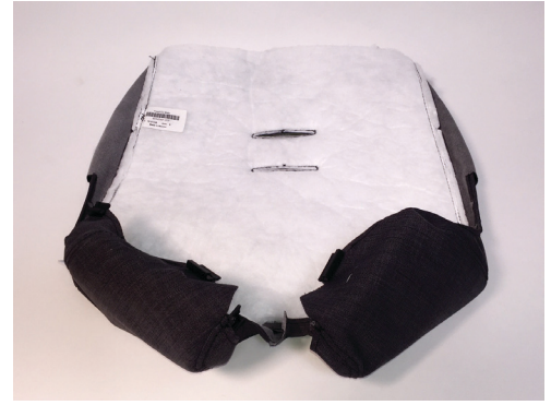
Bottom side of fabric